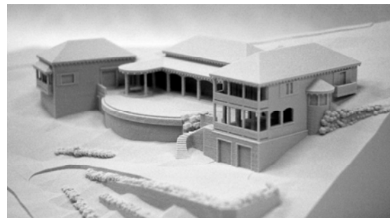
3D ARCHITECTURAL MODEL