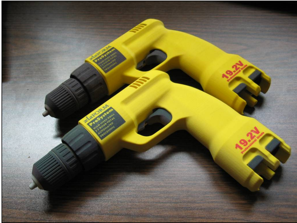
Foreground: ZP131 Background: ZP130

xlaFORM's automated infiltration system works even better with the new ZP131 ZCorp powder formulation. Improvements include brighter colors and less bleeding. Both of these drills were simultaneously completed in 90 minutes after printing. Now you can have great color and high part strength automatically.